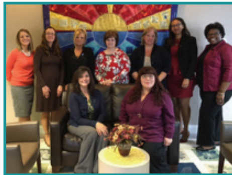
Counseling staff celebrating the opening of the new office in St. Clair Shores

On November 11, 2016, Turning Point proudly opened its doors at the new St. Clair Shores community outreach location! In doing so, Turning Point now can offer many services to an even broader area within the Metropolitan Detroit Area. Services for adults and children include individual counseling, group counseling, advocacy, and legal advocacy for survivors and their significant others or loved ones. The building is located at 27113 Harper Avenue, Suite A.